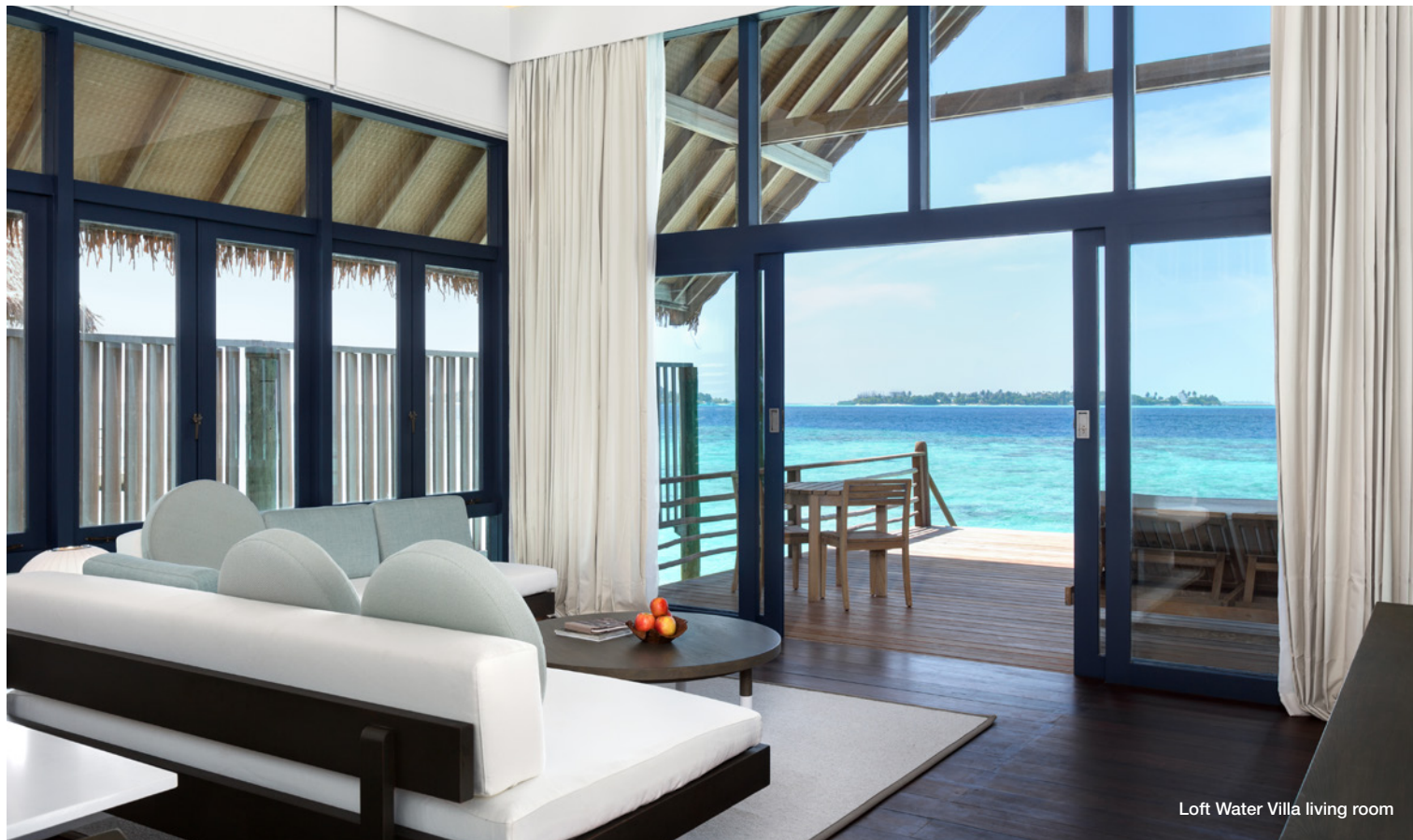
Loft Water Villa living room