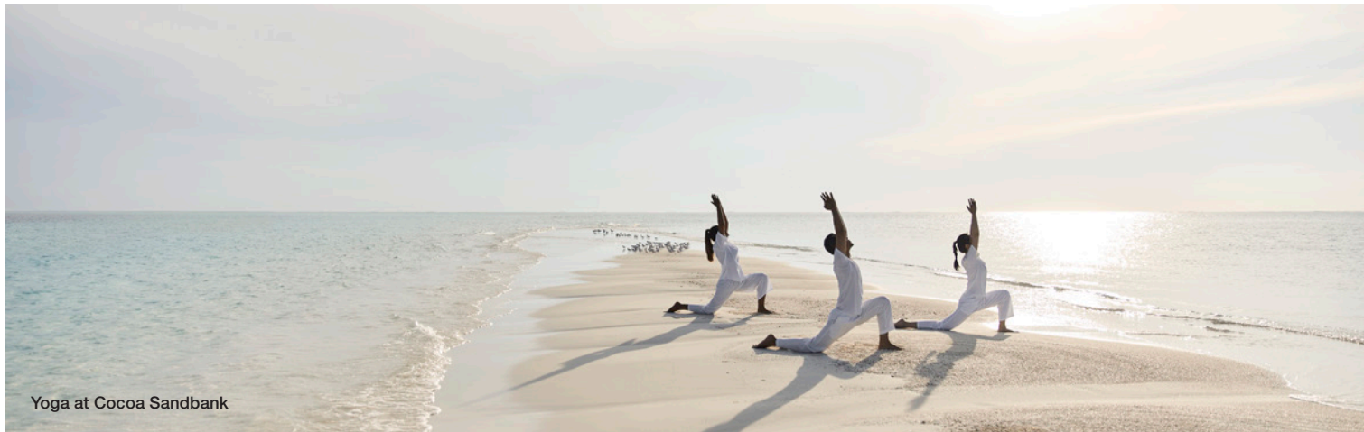
Yoga at Cocoa Sandbank