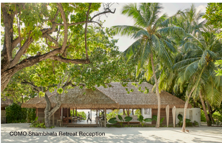
COMO Shambhala Retreat Reception