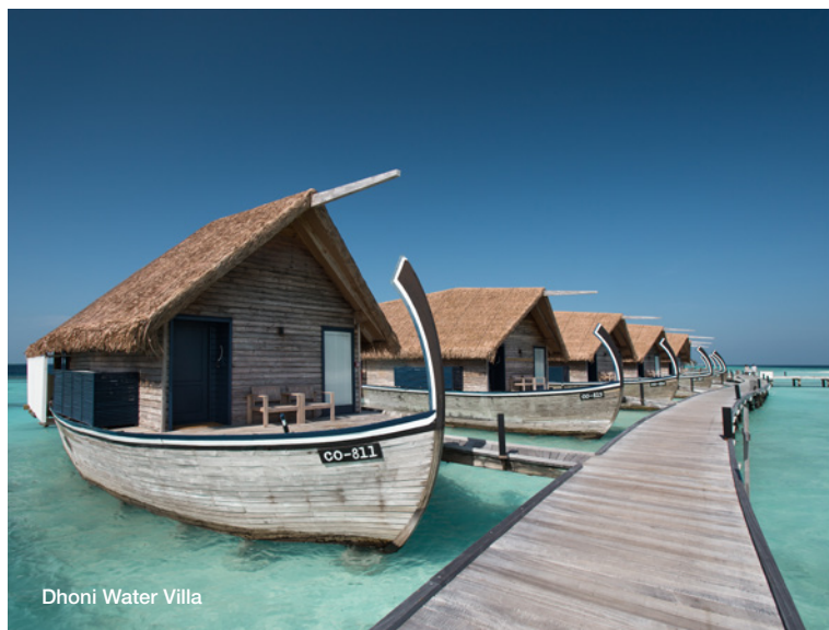
Dhoni Water Villa