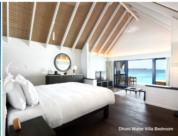
Dhoni Water Villa Bedroom