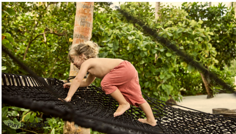
Play by COMO