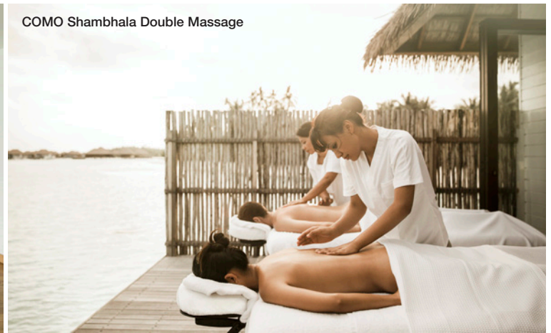
COMO Shambhala Double Massage