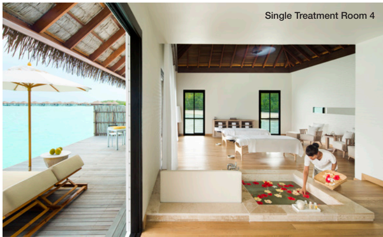
Single Treatment Room 4