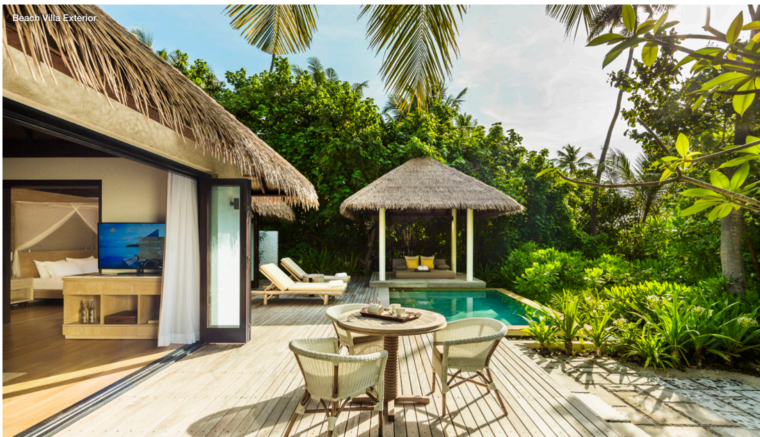
Beach Villa Exterior