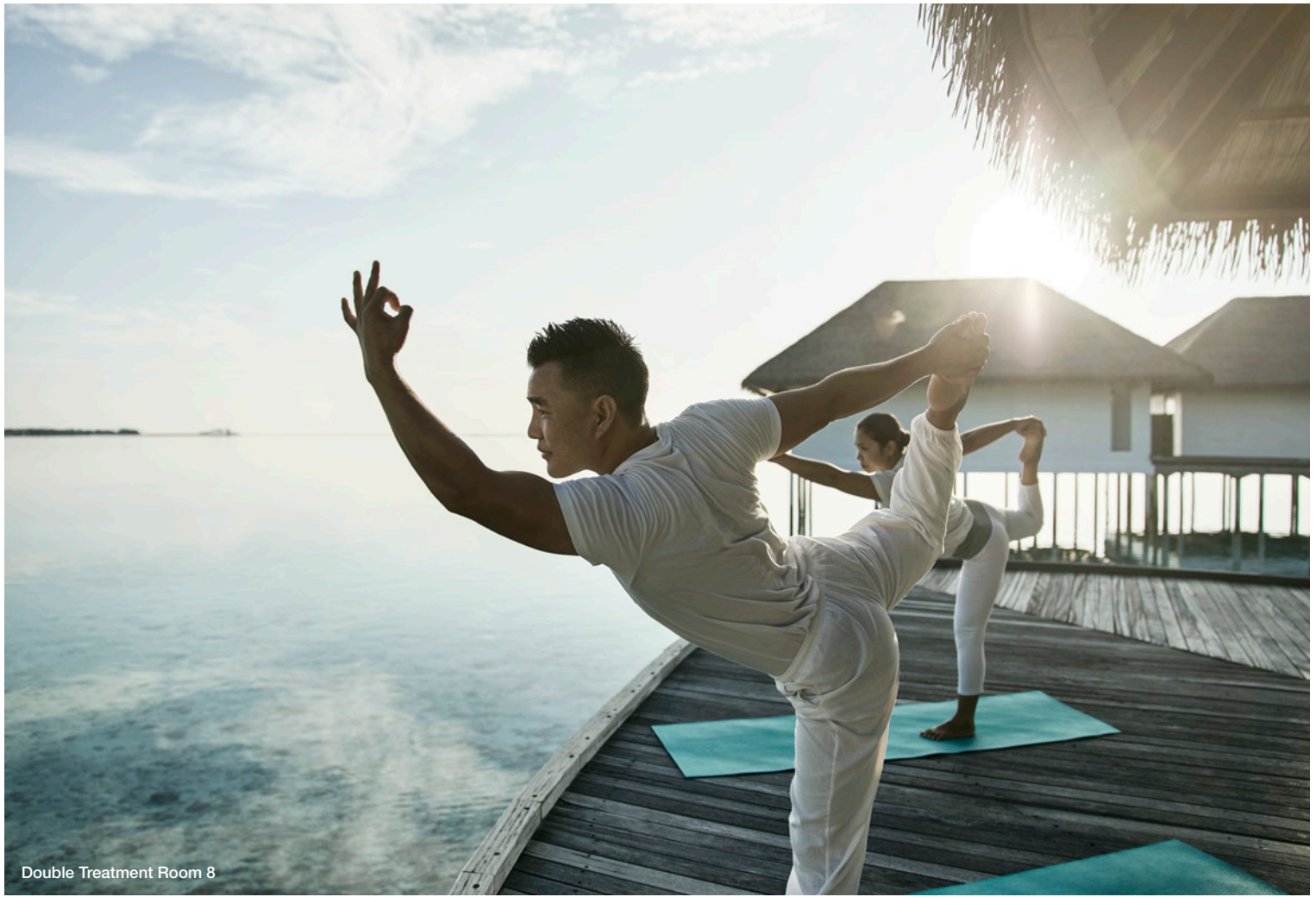
Double Treatment Room 8